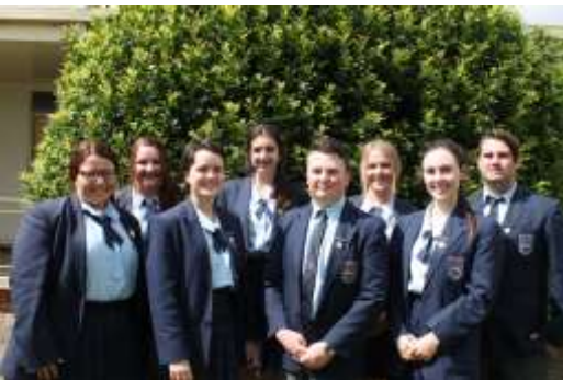
2015 Senior Councillors