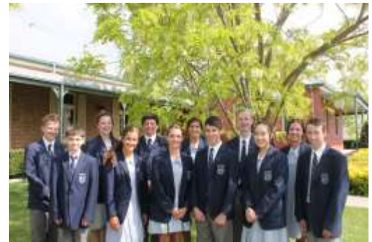
Student Representative Council