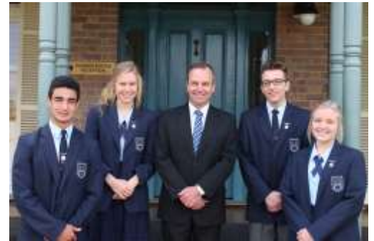
2015 School Captains & Vice Captains