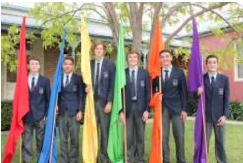
2015 House Captains