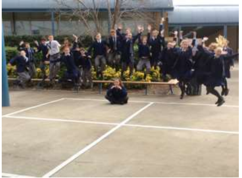
“Year 8 Jumping up and down for Kids”